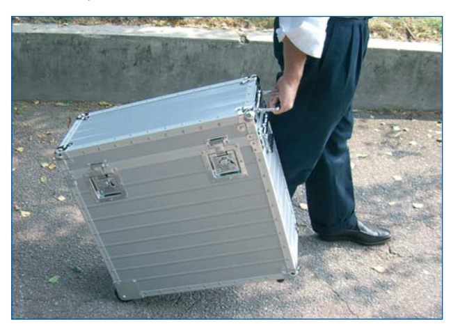
Heavy Duty Transport Case