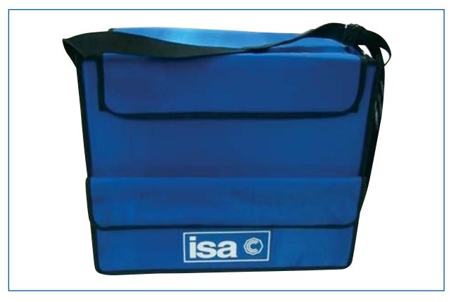
Plastic Carry Bag