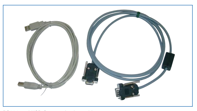
RS232 and USB Communication cables